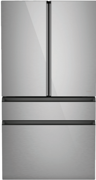
CJE23DM5WS5 Platinum Glass with Integrated Pockets