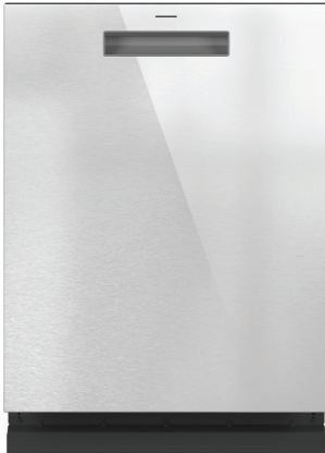
CDP888M5VS5 Modern Glass